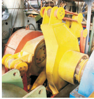
Saisidha Rope Coupling