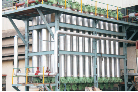
Patented Steam Saving System