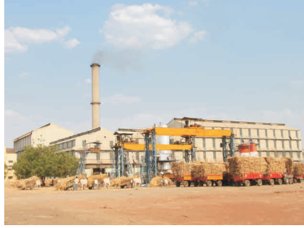
Turnkey Sugar & Co-generation Plants

Currently executing 3 overseas Turnkey Sugar Projects. A) 3500 t.c.d B) 1250 t.c.d C) 1000 t.c.d In Uganda.